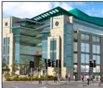
Royal & Sun Alliance

Acquisition of 20,000 m 2 in Park Place, Dublin 2 as new corporate headquarters.