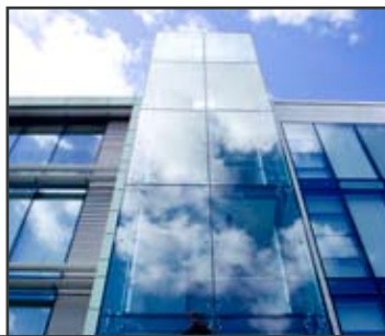
J P Morgan

Acquisition of 1,500m 2 in Dolmen House, Dublin 2 as expansion space and advisers in acquisition of new headquarters of 20,000m 2 .